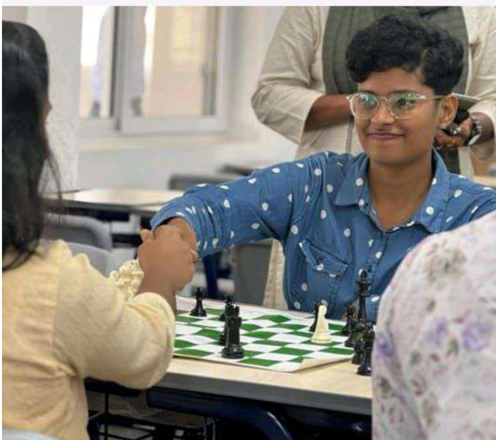
23: A Match in the Intercollegiate Chess Tournament is Progress

A Quality Initiative by the IQAC of the College