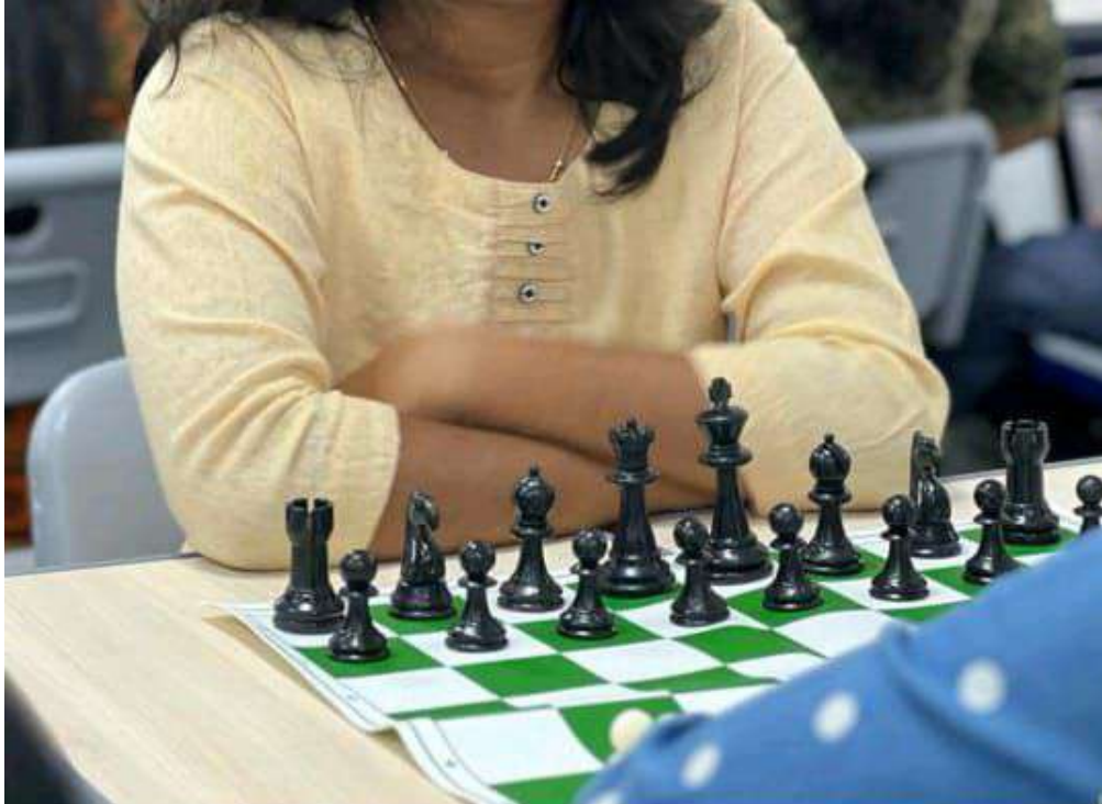
22: A Match in the Intercollegiate Chess Tournament is Progress